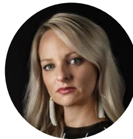
KATHERINE A. JOHNSON